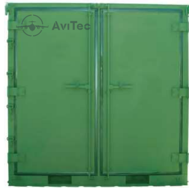
Wheel Restraint Security Kit (WRSK) Container double door end