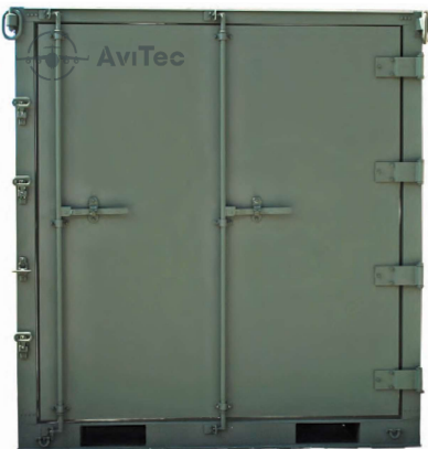
Wheel Restraint Security Kit (WRSK) Container single door end with dual lock rods

For more information or for a single part number for a customized ISU® Container, call 800-355-2015