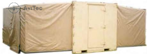
ELAMS deployed in expanded mode.