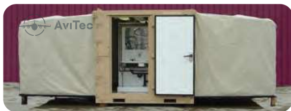
ELAMS deployed and configured with an ablation unit

For more information or for a single part number for a customized shelter, call 800-355-2015