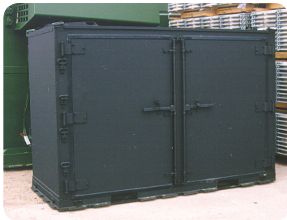
ISU® 72.5 shown painted in optional black

*Above part numbers are for containers only; no accessories