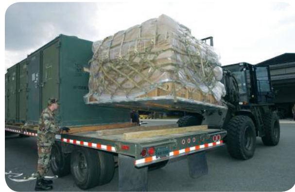
HCU-6/E Pallet shown with cargo secured with net (sold separately) being lifted onto flatbed trailer